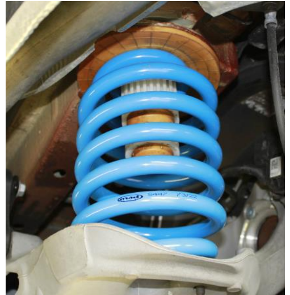
Reinforced rear spring