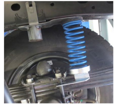
Auxiliary springs HV-064230